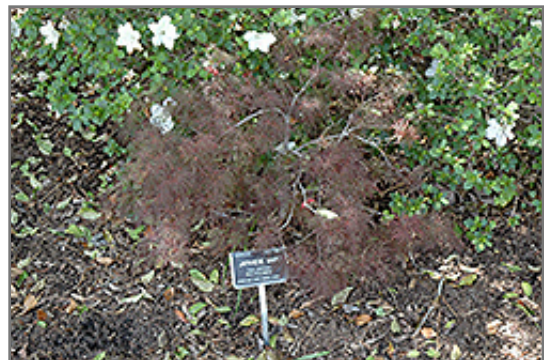
Red Feathers Japanese Maple