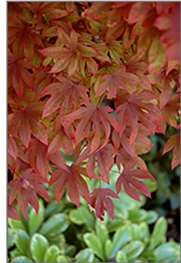
Adrians Compact Japanese Maple foliage