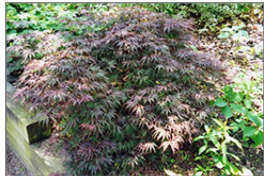
Cutleaf Japanese Maple