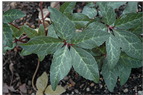
Merlin Hellebore foliage