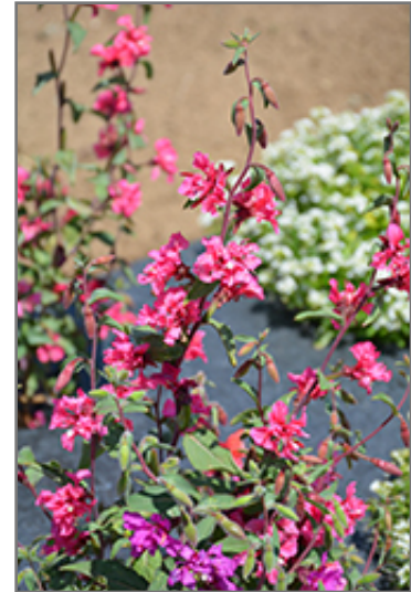
Sriracha Rose Cuphea flowers