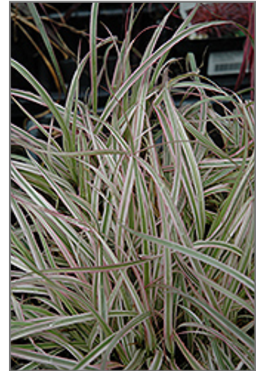
Cherry Sparkler Fountain Grass foliage

Cherry Sparkler Fountain Grass is recommended for the following landscape applications;