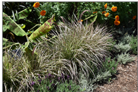
Cherry Sparkler Fountain Grass