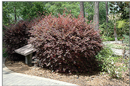
Daruma Chinese Fringeflower