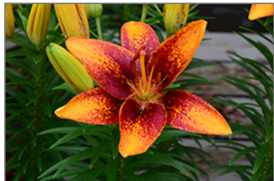
Lily Looks Tiny Orange Sensation Lily flowers