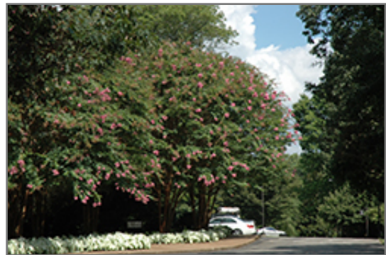
Miami Crapemyrtle in bloom