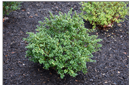
Green Lustre Japanese Holly