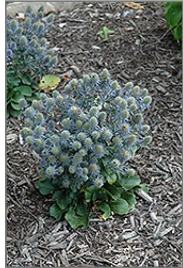
Tiny Jackpot Sea Holly

Tiny Jackpot Sea Holly is recommended for the following landscape applications;