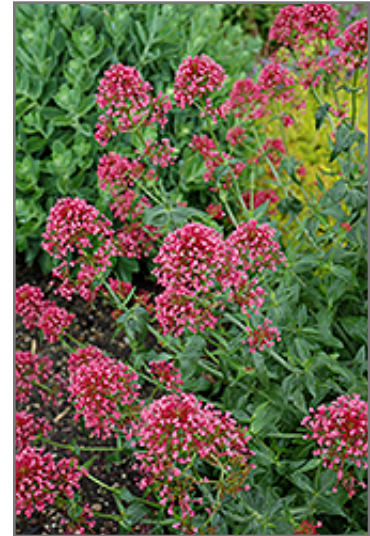
Red Valerian flowers

Red Valerian is recommended for the following landscape applications;