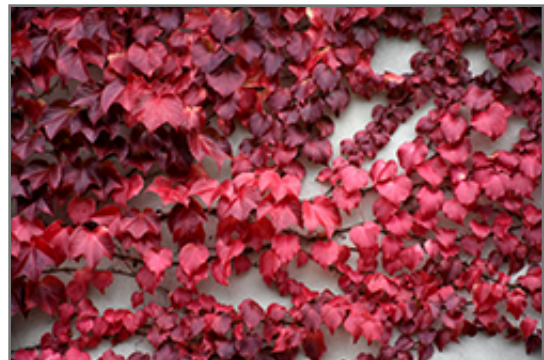
Veitch Boston Ivy in fall