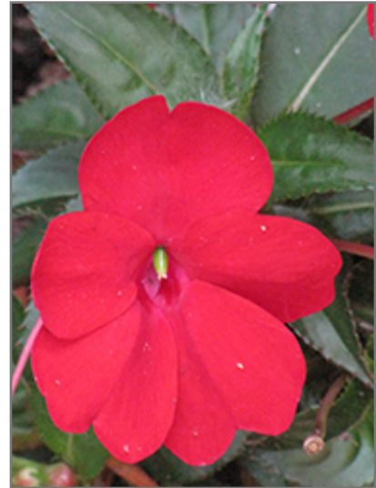
SunPatiens Compact Red New Guinea Impatiens flowers

This plant will require occasional maintenance and upkeep, and should not require much pruning, except when necessary, such as to remove dieback. It is a good choice for attracting bees and butterflies to your yard. It has no significant negative characteristics.