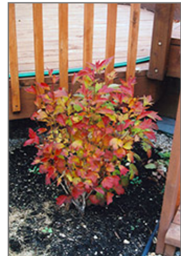
Compact Highbush Cranberry in fall