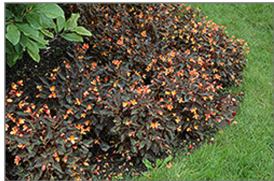
Sparks Will Fly Begonia in bloom