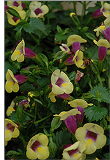
Yellow Moon Torenia flowers

Yellow Moon Torenia is recommended for the following landscape applications;