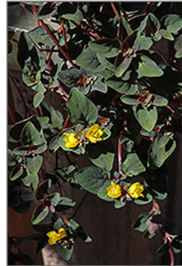
Persian Chocolate Loosestrife flowers

Persian Chocolate Loosestrife is recommended for the following landscape applications;