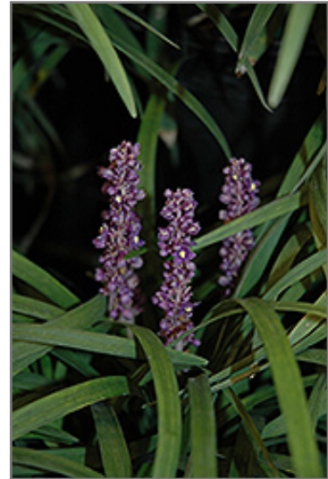
Majestic Lily Turf flowers