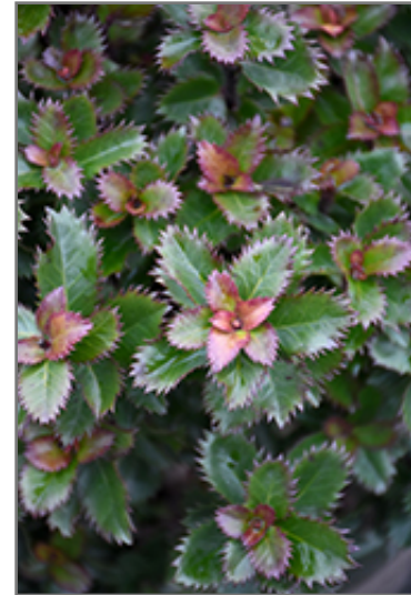
Sallywag Holly foliage