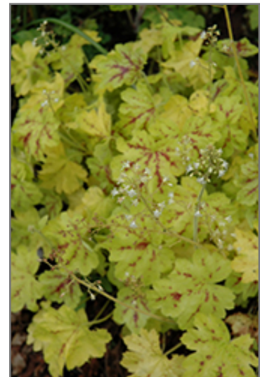
Solar Power Foamy Bells flowers