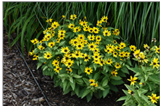
Sunburst False Sunflower in bloom