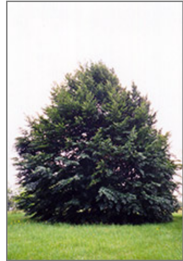
European Beech