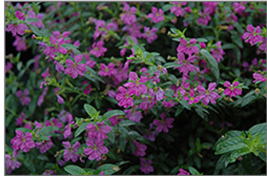
Allyson Mexican Heather flowers