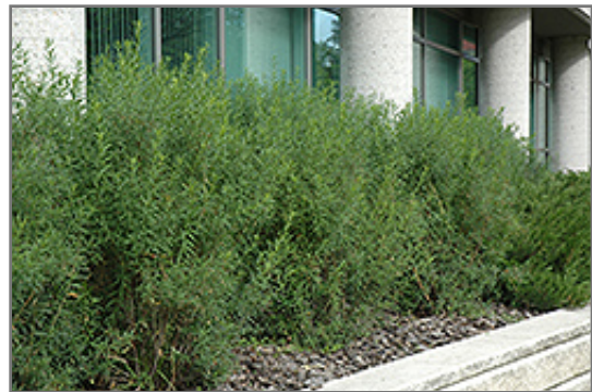
Dwarf Turkestan Burning Bush