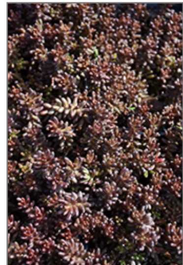
Murale Stonecrop foliage