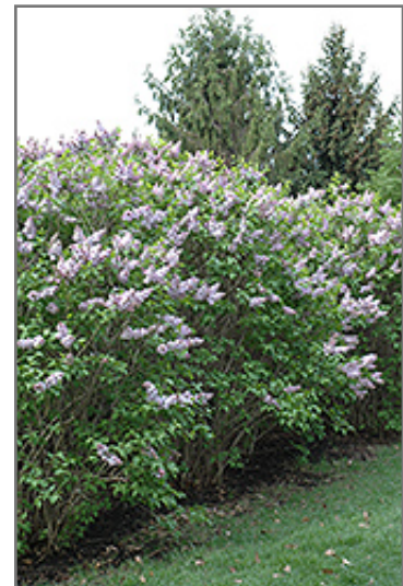
Blanche Sweet Lilac in bloom