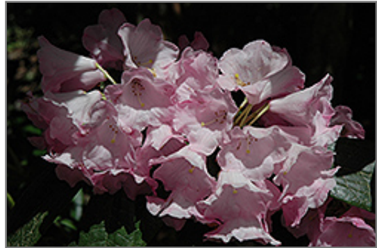
Silverleaf Rhododendron flowers