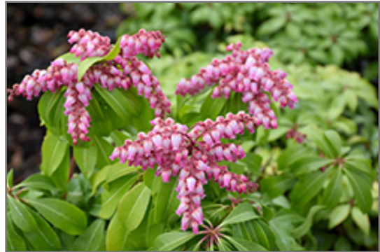
Shojo Japanese Pieris flowers

Shojo Japanese Pieris is recommended for the following landscape applications;