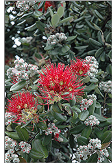
Pohutukawa flowers