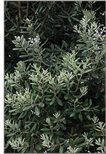
Pohutukawa foliage

This tree should only be grown in full sunlight. It does best in average to evenly moist conditions, but will not tolerate standing water. It is particular about its soil conditions, with a strong preference for rich, acidic soils, and is able to handle environmental salt. It is somewhat tolerant of urban pollution, and will benefit from being planted in a relatively sheltered location. This species is not originally from North America.