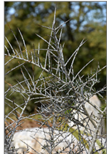
Narrow-leafed Mahoe foliage