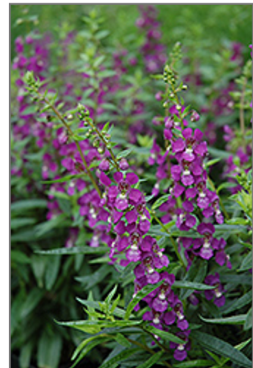
Serenita Purple Angelonia flowers