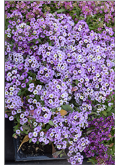
Clear Crystal Lavender Shades Sweet Alyssum flowers

Clear Crystal Lavender Shades Sweet Alyssum is recommended for the following landscape applications;