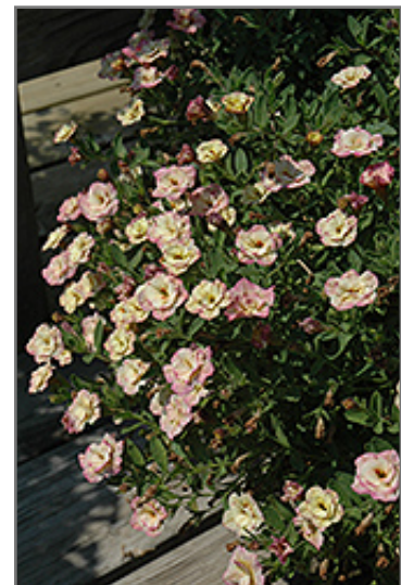
MiniFamous Double Rose Chai Calibrachoa flowers