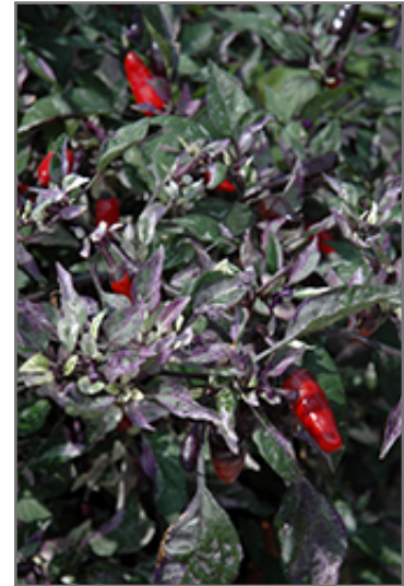
Calico Ornamental Pepper fruit