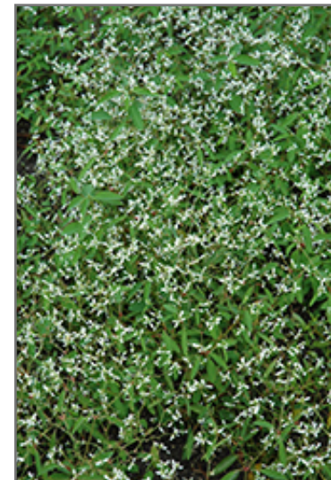
Breathless White Euphorbia flowers