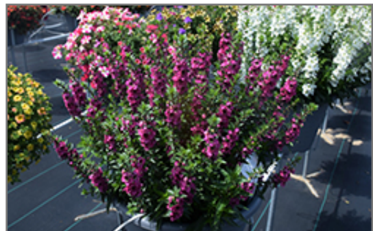
Archangel Raspberry Angelonia in bloom