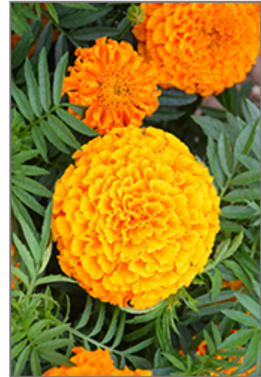
Taishan Orange Marigold flowers