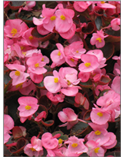
Bada Boom Pink Begonia flowers