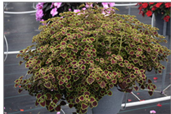
Burgundy Wedding Train Coleus