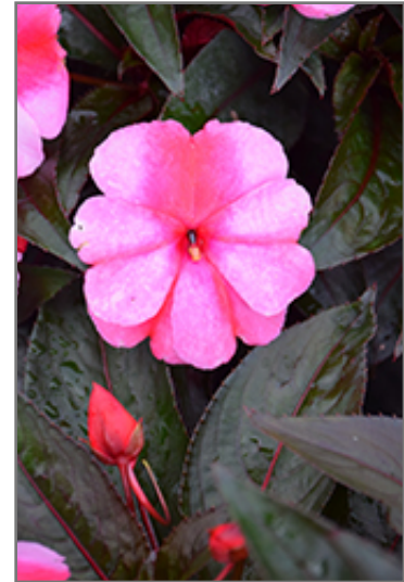
Super Sonic Sweet Cherry New Guinea Impatiens flowers

Super Sonic Sweet Cherry New Guinea Impatiens is recommended for the following landscape applications;