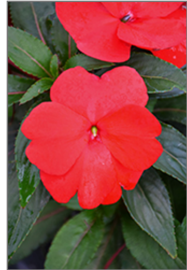
Super Sonic Red New Guinea Impatiens flowers

Super Sonic Red New Guinea Impatiens is recommended for the following landscape applications;