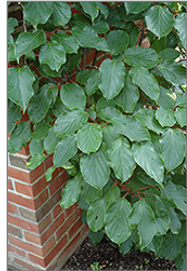
Weiki Hardy Kiwi foliage