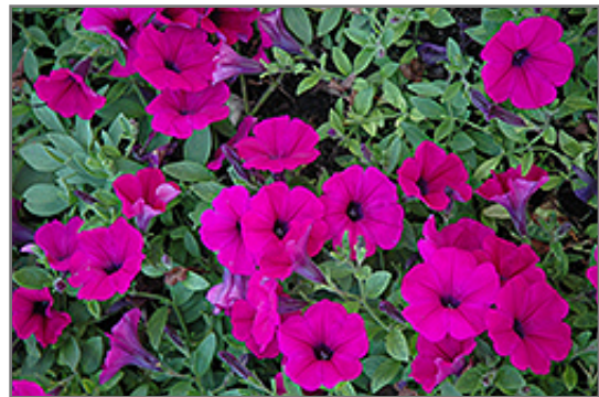
Wave Purple Classic Petunia flowers