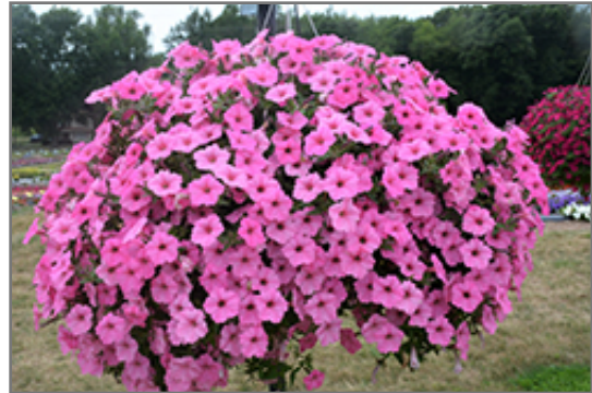
Supertunia Vista Bubblegum Petunia in bloom

Supertunia Vista Bubblegum Petunia will grow to be about 18 inches tall at maturity, with a spread of 24 inches. When grown in masses or used as a bedding plant, individual plants should be spaced approximately 20 inches apart. Its foliage tends to remain dense right to the ground, not requiring facer plants in front. This fast-growing annual will normally live for one full growing season, needing replacement the following year.