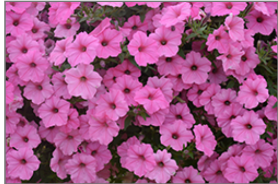
Supertunia Vista Bubblegum Petunia flowers

Supertunia Vista Bubblegum Petunia is recommended for the following landscape applications;