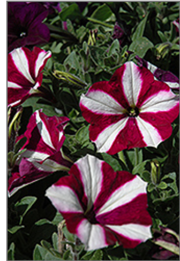
Easy Wave Burgundy Star Petunia flowers

Easy Wave Burgundy Star Petunia is recommended for the following landscape applications;