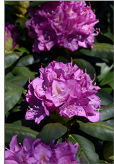
Roseum Elegans Rhododendron flowers