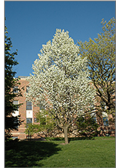
Mountain Frost Pear in bloom

Mountain Frost Pear is recommended for the following landscape applications;