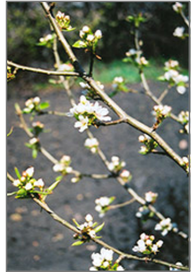
Mountain Frost Pear flowers

This tree should only be grown in full sunlight. It does best in average to evenly moist conditions, but will not tolerate standing water. It is not particular as to soil type or pH. It is highly tolerant of urban pollution and will even thrive in inner city environments. This is a selected variety of a species not originally from North America.