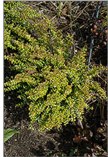
Twiggly Box Honeysuckle