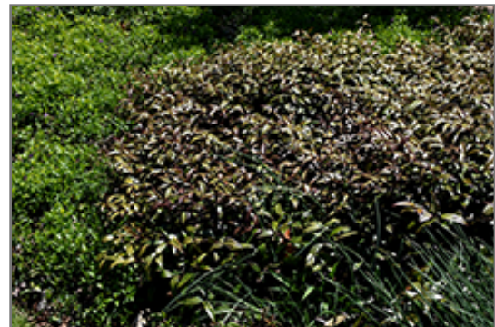
Scarletta Fetterbush